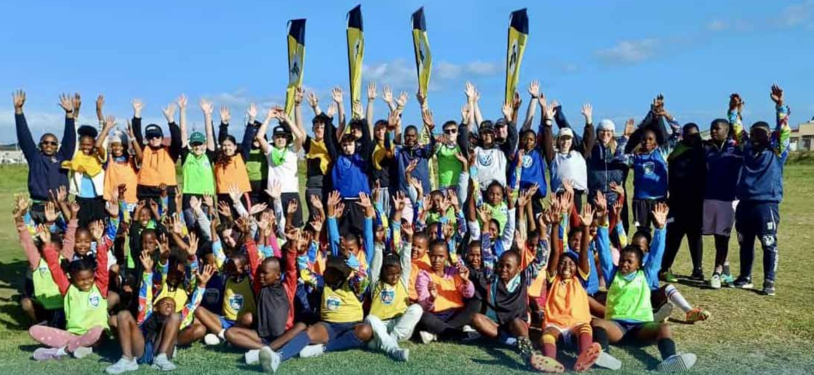
South Africa Trip 2024